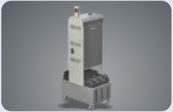
Positive ink pressure system