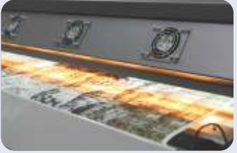
Under Fabric Heater & Tunnel Dryer