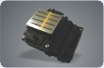
EPSON Printhead 8 colours