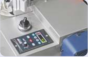
Pneumatic Feed & Fabric Takeup