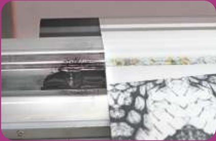
Flexible Ink Gutter