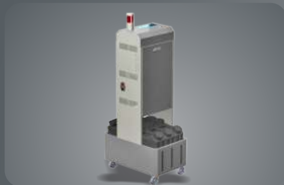
Positive ink pressure system