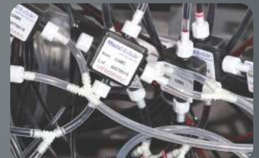
Degassing System for Nano & Max (Optional for Hexa)